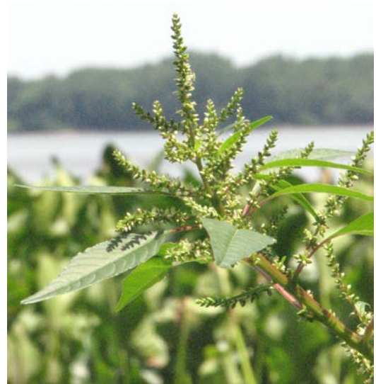
Salt-marsh water-hemp ( Amaranthus cannabinus )

Salt-marsh Water-hemp has a distribution from Maine south along the coast into Florida and west into Louisiana. In Pennsylvania, it has been documented in a few southeastern counties along the Delaware River. Salt-marsh Water-hemp grows in intertidal marshes, mudflats, and river shores, where it is subjected to daily fluctuations in water levels.